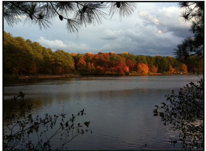
Scenic Fall View of Candler Lake in Murphey Candler Park

The MCPC was created last year by a similar group of concerned citizens (independent of DeKalb County and the City of Brookhaven) and were recently approved as a 501(c)3 non-profit. The Conservancy's vision is, with input from stakeholders/neighbors, to establish Murphey Candler Park as a pre-eminent park in metro Atlanta by enhancing and