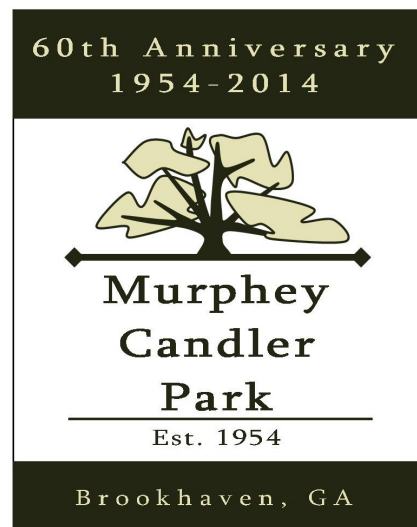
Commemorative Signage to mark 60th Birthday of Murphey Candler Park

In addition, we are proud to announce that through the generosity of many neighbors, we have currently