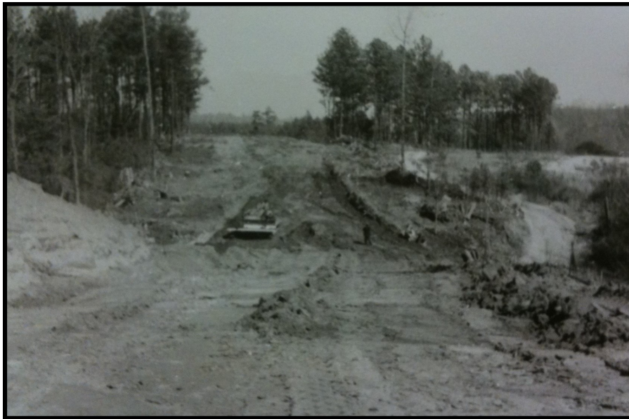
Entrance Road to Murphey Candler Park from Ashford Dunwoody Road (now known as West Nancy Creek Drive).